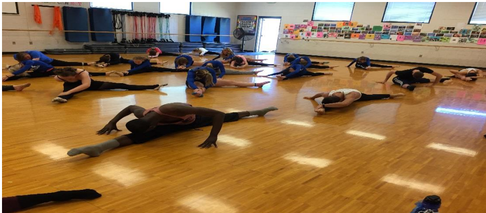
Warm up in the FHS Dance Studio

Students were invited to attend their performance at the Browning Center on Oct 6.